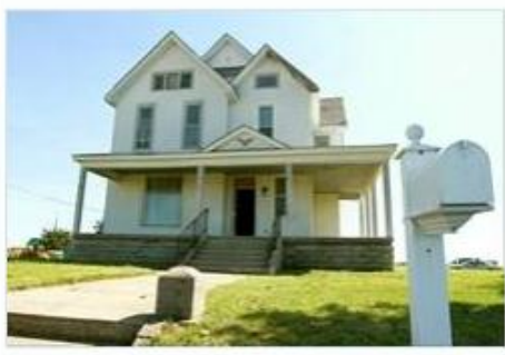
The Dunham house in Kempton, Ind., is the subject of a documentary film project about President Barack Obama's ancestral roots in Indiana.