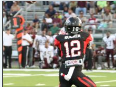
High school football rankings