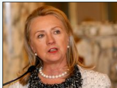
Clinton: I'm responsible for consulate security