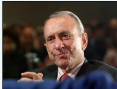
Friends memorialize ex-Sen. Arlen Specter in Pa.