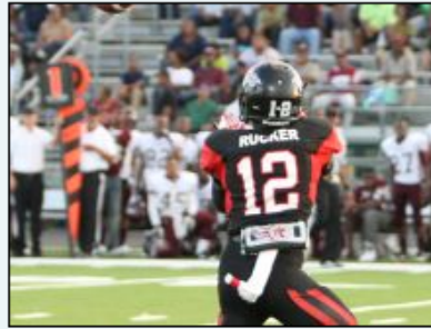
High school football rankings