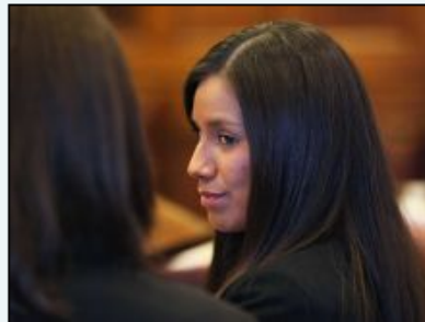
Release of names in prostitution case stirs debate