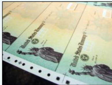
Social Security benefits get a 1.7 percent bump