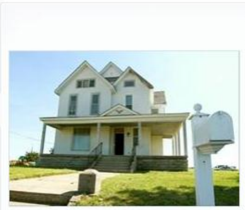
The Dunham house in Kempton, Ind., is the subject of a documentary film project about President Barack Obama's ancestral roots in Indiana.